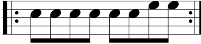
Fun With Toms! Line 2/Bar 3