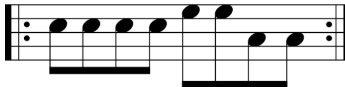
Fun With Toms! Line 2/Bar 2