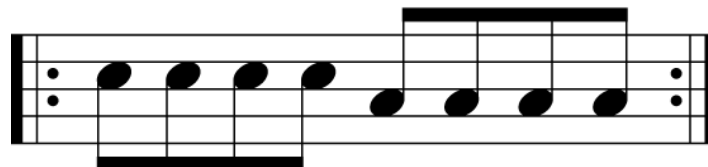
Fun With Toms! Line 3/Bar 2